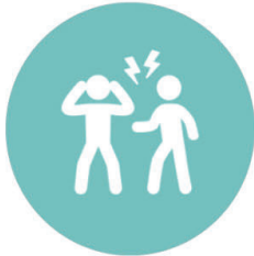
EXPERIENCE IN-PERSON BULLYING

WHAT HAPPENS TO KIDS DURING CHILDHOOD SHAPES WHO THEY BECOME. BULLYING IS OFTEN WRITTEN OFF AS A RITE OF PASSAGE AS “KIDS JUST BEING KIDS.” HOWEVER, CYBERBULLYING CAN HAVE LASTING NEGATIVE PHYSICAL, PSYCHOLOGICAL, AND EMOTIONAL EFFECTS. CHILDREN WHO ARE INVOLVED IN CYBERBULLYING MAY: