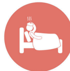
HAVE MORE HEALTH PROBLEMS