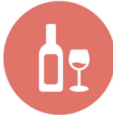
ABUSE DRUGS & ALCOHOL